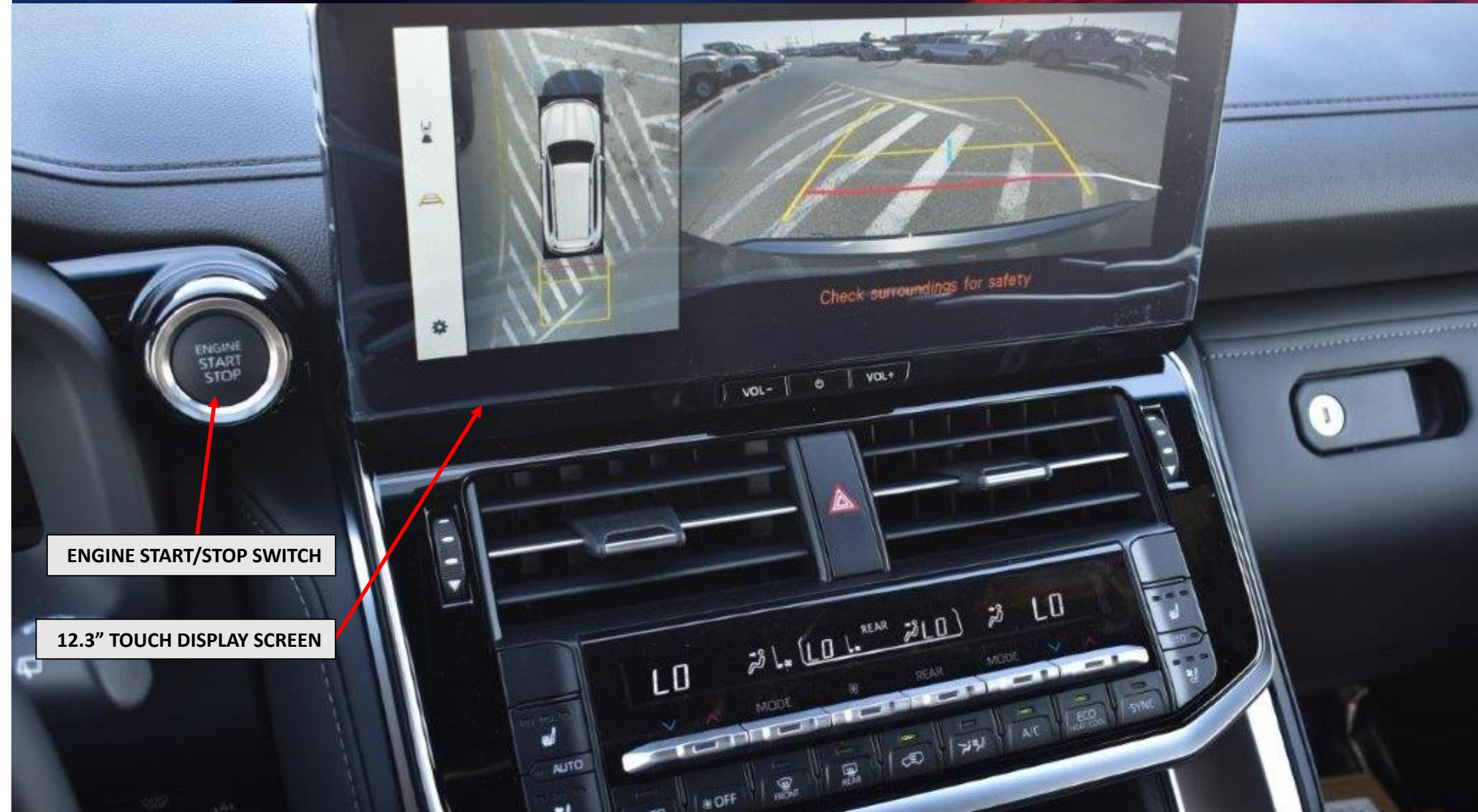
ENGINE START/STOP SWITCH